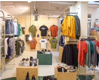
22 FUNKIE HOUSE

Funkie House is a home to both men and women who are into premium streetfashion, footwear and accessories. Have you seen our completely renewed store interior? It's filled with a mixture of authentic brands and new promising labels. Ranging from Obey, Carhartt WIP, Patagonia and VANS to name a few!