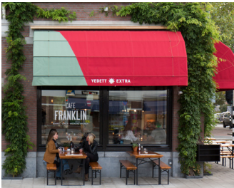
1 CAFE FRANKLIN

Dunne Bierkade 1a +31 70 889 33 30 Tue-Sun 10.00-23.30