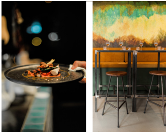
6 DE GROENE PAREL

Koningin Emmaplein 3 Tue-Sun 11.00-23.00