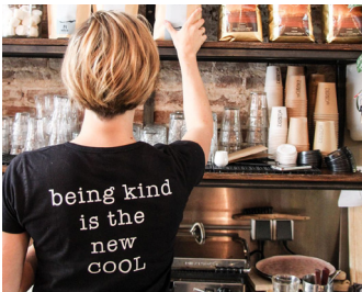
6 BIJ CLARENCE

Weimarstraat 19 Tue-Sat 12.00-18.00 / Sun 12.00-17.00