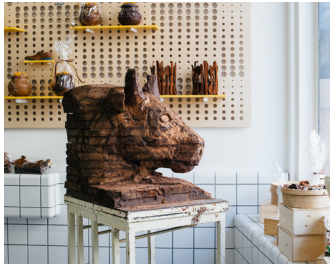
24 DE BONTE KOE

Papestraat 26a Tue-Wed 20.00-02.00 Thu-Fri 16.00-02.00 / Sat 15.00-02.30