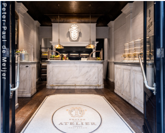
21 FRITES ATELIER

Prinsestraat 2c Mon 12.00-18.00 / Tue-Wed 10.30-18.00 Thu 10.30-20.00 / Fri 10.30-18.00 Sat 10.00-18.00 / Sun 13.00-17.30