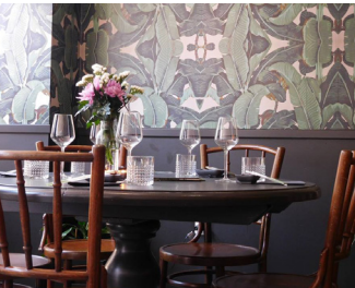
5 DE SUSHIMEISJES

Van Bylandtstraat 92 Mon 08.00-18.00 / Wed-Fri 08.00-18.00 Sat-Sun 09.00-18.00