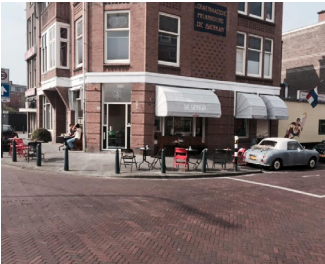
4 DE SIERKAN

Whereas in the old times people came to the - then white tiled - milk institution named De Sierkan (meaning 'decorated milk can'), nowadays De Sierkan is a colourful small bistro just outside the city centre where they offer a delicious international cuisine, reasonably priced and made with fresh, mostly all bio products. During spring and summer you can enjoy your meals - including breakfast and lunch - also on the sunny terrace.