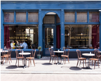
11 WALTER BENEDICT

Anna Paulownaplein 13 / 16 +31 70 363 00 02 Mon-Fri 09.00-21.30 Sat-Sun 10.00-21.30