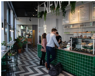
25 NEW FORK

Venestraat 7 Mon-Wed 11.00-20.00 / Thu 11.00-22.00 Fri-Sun 11.00-20.00