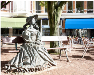
9 ROOM / DE KAMER HIERNAAST

Prins Hendrikstraat 96 kitchen open Mon-Wed 16.00-21.00 Thu-Sun 12.00-21.00 restaurant open till 23.00