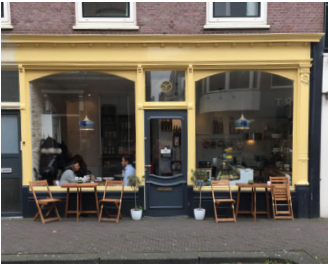
23 NEFELI DELI

Oude Molstraat 11a +31 70 360 35 98 Tue 10.00-16.00 / Wed-Sun 10.00-01.00