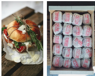
27 BUDAPEST BAGEL

Korte Houtstraat 14c +31 70 215 75 47 lunch Tue-Sat 11.00-16.00 dinner Wed-Sat 17.00-22.00