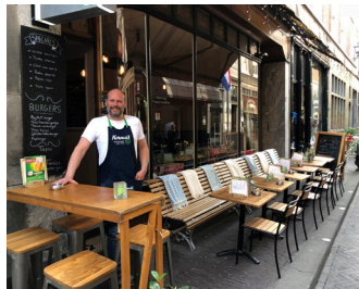
14 BIJ HEM

Piet Heinstraat 60a Mon-Fri 07.00-17.00 Sat-Sun 08.00-17.00