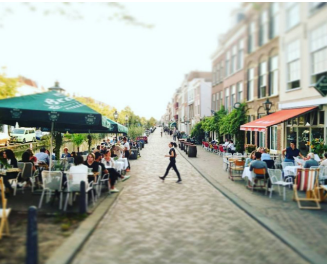
26 DE KADE

Korte Poten 57 Mon 12.00-18.00 / Tue-Wed 10.00-18.00 Thu 10.00-19.00 / Fri-Sat 10.00-18.00 Sun 12.00-17.00