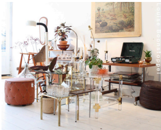
2 SPRINKEL + HOP

Rijnstraat 10 +31 6 82 46 38 95 Mon-Sat 09.00-22.30 / Sun 11.00-18.00