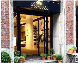
16 BARETTA JEANS

Noordeinde 162 Tue-Fri 08.00-16.00 / Sat 09.00-17.00 Sun 10.00-16.00