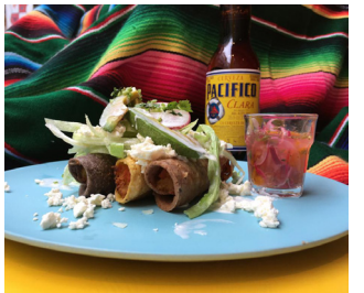
26 CENCALLI LA CASA DEL MAÍZ

Schoolstraat 35 Mon 12.00-18.00 / Tue-Wed 10.00-18.00 Thu 10.00-21.00 / Fri 10.00-16.00 Sat 10.30-17.30 / Sun 12.00-17.00