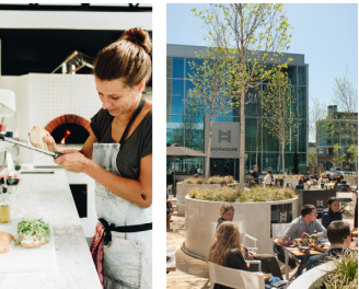
30 FOOD COURT HOFHOUSE

Share your favorite Day Hague pictures on Instagram with #dayhague