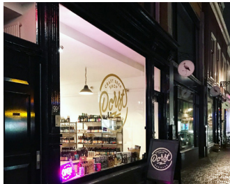
28 DORST CRAFT BEER SHOP

Share your favorite Day Hague pictures on Instagram with #dayhague