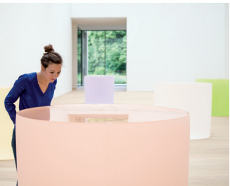
31 MUSEUM VOORLINDEN

Surrounded by nature and a beautiful garden by Piet Oudolf, this brand new museum is arranged completely in service to the art. Its gracious building houses ever-changing exhibitions and numerous impressive permanent artworks by names like Richard Serra, James Turrell, Roni Horn and Ron Mueck.